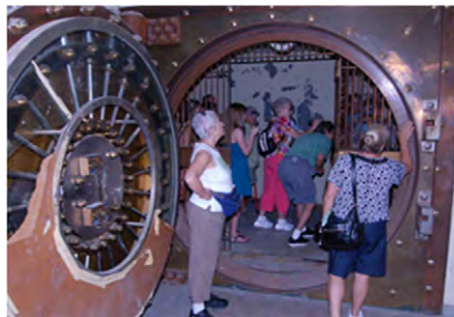
Secret bank vault