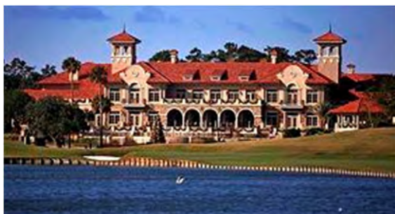
Clubhouse at TPC Sawgrass