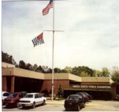
National Headquarters Raleigh, North Carolina

IT is a service department. We interact with all the other HQ departments and with USPS® squadrons and members. It is never a dull place. We continually strive to know how every department functions. We design and maintain the data files and programs that enable every HQ department to access and use information. Changes in the way USPS does business and special requests, affect the IT department. Sometimes a change is an opportunity for us to do something in a better way. At other times it means we work hard to solve an information-processing problem so that USPS members can have easier access to data.