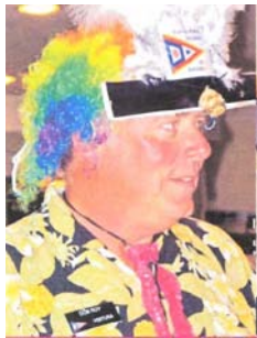
Our Fearless (obviously) Leader