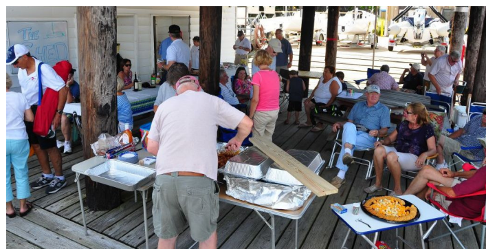
The Commander's cocktail party and pot luck dinner wrapped up Saturday after a full day of activity.