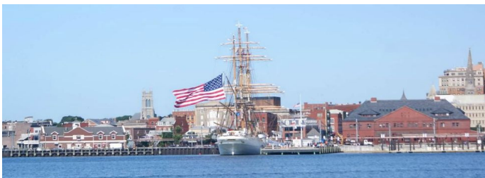
Approaching the Coast Guard Academy from the water.