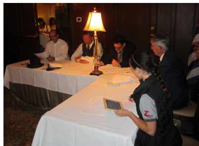
Members of the New Haven Squadron reenacted the Examining Board discussion with a great deal of artistic license and humor.