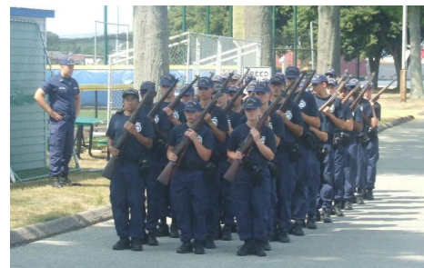
The cadets were out in full force for the whole weekend.