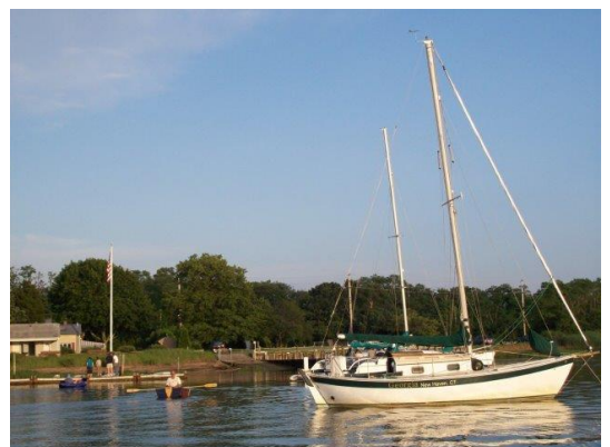
Mattituck Park District dock