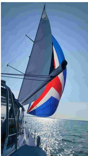
<-Sailing to Greenport, NY and flying our spinnaker.