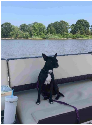
<-1st mate Shelby, our family dog enjoying a day anchored at Nott Island Essex aboard Let It Go .