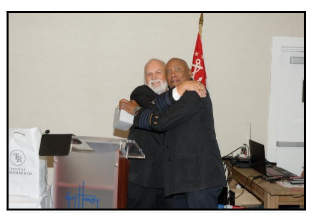
D/23 Spring Conference in St. Augustine. Good times at Change of Watch farewells.

My participation in subsequent courses enabled me to advance and hone my skills in piloting; membership and participation in the USPS also afforded contact in an association with men and women of like mind. The next five years I was changing boats as my knowledge and experience dictated. The final 42 foot twin diesel satisfied and challenged my boating skills. Again I am thankful for the camaraderie and fellowship from the men and women who make up the USPS.