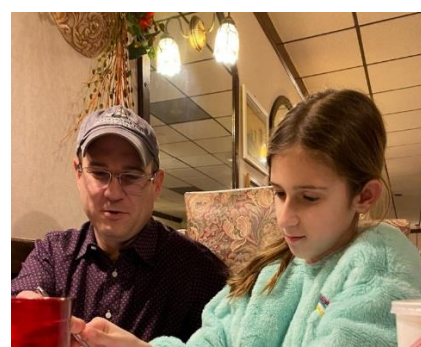
Members battle it out for the 'labels' category. Winners were the 'Fantastic Four', seen in top middle photo. A wonderful evening's entertain