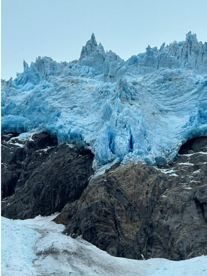
One of the terminuses for Salmon Glacier near Hyder, AK.