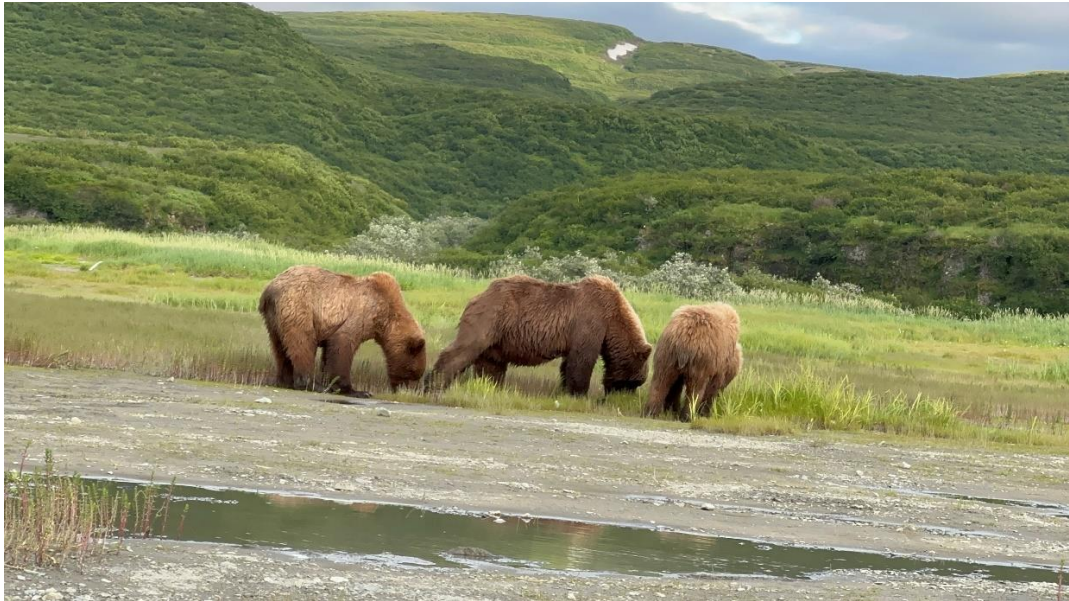
Grizzly mother (center) with 3-year-old cubs.

Grizzly bears in McNeil River State Game Sanctuary, across Cook Inlet from Homer, AK. These are the pictures easily accessible, taken with my phone.... can't wait to see the good photos! We saw a minimum of 47 grizzlies at one time in the falls this visit.... up to 144 individual bears identified so far in 2023 in the sanctuary. Fishing for coho (silver) & humpback (pink) salmon.