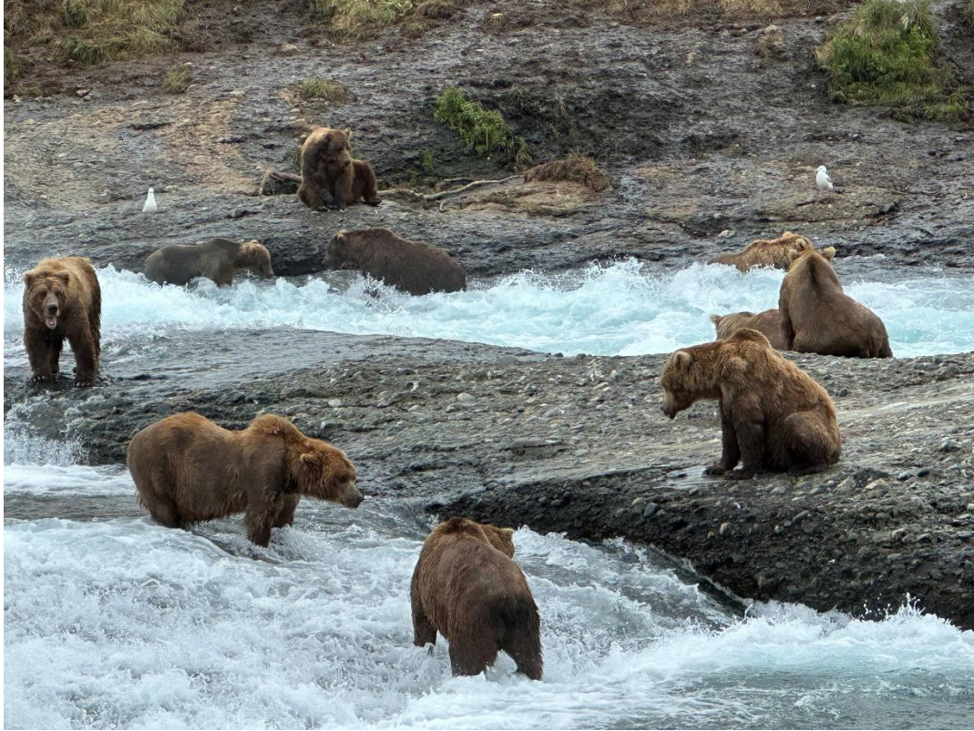
High count of 47 grizzlies fishing at falls at one time during my visit... season high in 2023 was 67.