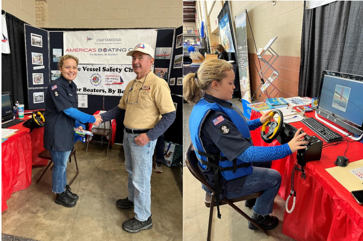
Our volunteers from the Sea Scouts