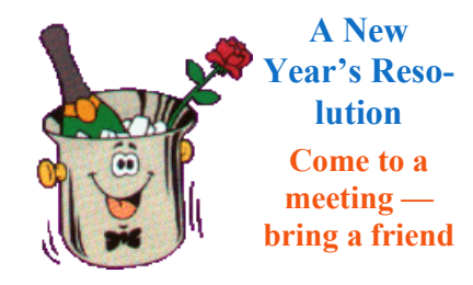
Kingsway Lights the Way

events. If you're still on the fence about helping out on a committee, or want to become a bridge member, it's not too late. Jump off the fence and join us.