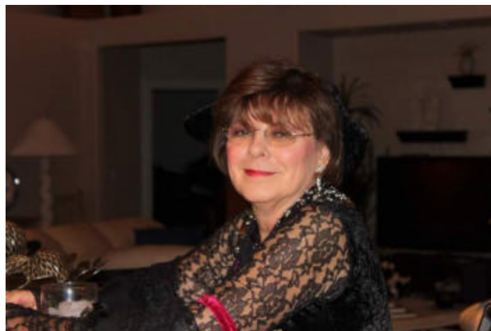
Maybe This Is Why