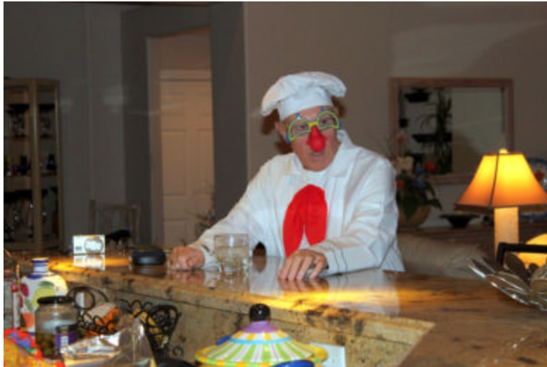
Sometimes I Wonder Why I Keep Doing This