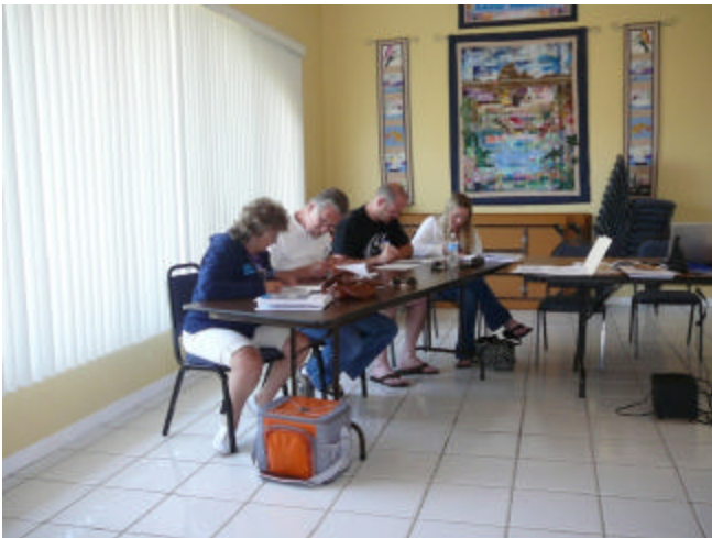
Hitting The Books