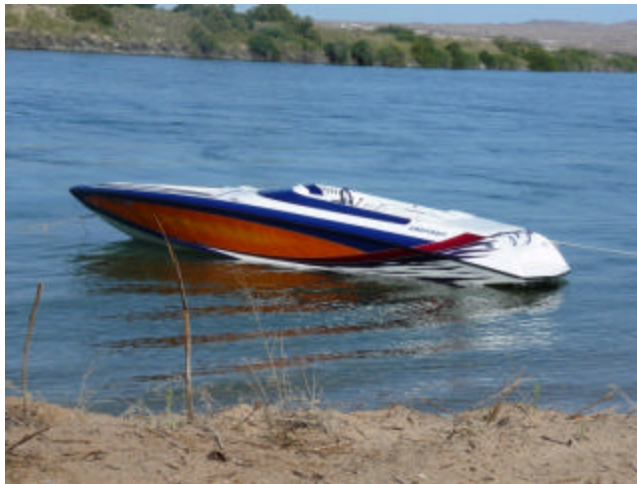
Waller's Lil Boat

Occasionally I get asked what kind of boat my son has, and I am sure some of you are also curious as to what it is I hang out on when I am actually hanging out on the water. Well, here she is: