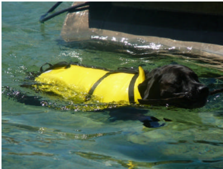
Emma Taking A Swim

HOT & HOT were the words for Saturday night! Temperatures were reported to be 105 by 4:00 PM with a breeze under 5 mph. The group met under the ramada at the Katherine Landing picnic area for an evening BBQ. After grilling various meats, we enjoyed a pot luck dinner. As the sun set, we began to cool down and we were all happy to see the temperatures cool to 90 degrees. Thanks to Dan Sheen for bringing the lights and