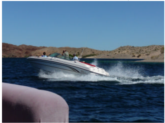
The Aquastar Making A Run Up The Lake