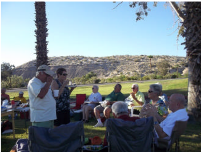
Members Enjoying The Afternoon Sun