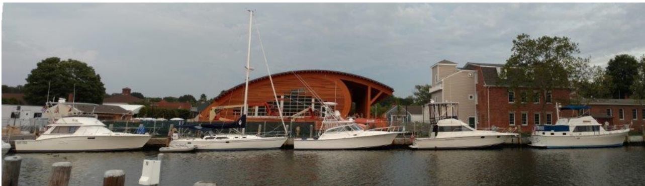
Some of the District 1 "Fleet" lined up at Mystic Seaport.

District members converged on Mystic Seaport on 12 August to enjoy a weekend of Seaport activities. Members could enter all of the Seaport exhibits including the whaling ship, Charles W. Morgan, as part of their docking fee.