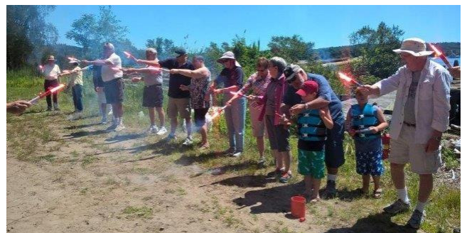
Members learned how to light and handle hand flares and how to shoot aerial flares.

The District returned to the Brewer Essex Island Marina for the 2 nd year for its annual June Rendezvous and Council meeting. Members and guests enjoyed activities including a large turnout for the flare demo and an excellent picnic.