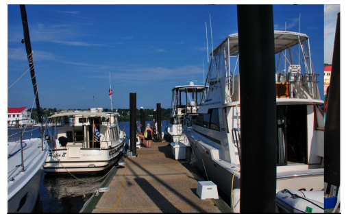
Part of the D-1 "fleet".