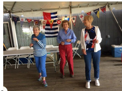
Some of the ladies enjoyed the sounds of the “Roadrunners”.