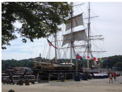
The Charles W. Morgan at rest at Mystic Seaport. 2016

District members and guests enjoyed a Mini Cruise to Mystic Seaport on 13-15 July. The docking fee included free entrance to all of the exhibits at the seaport.