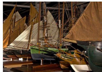
Model ships on display at the Mystic Seaport museum.

District members and guests enjoyed a Mini Cruise to Mystic Seaport on 13-15 July. The docking fee included free entrance to all of the exhibits at the seaport.