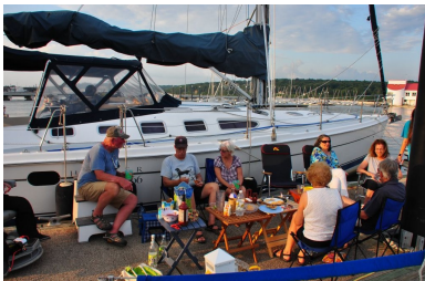
Cocktails on the dock.