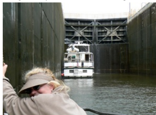
Hanging on to the "drop line" to hold the boat against the wall during filling and emptying of the lock.

Other canal sites General info: www.eriecanal.org