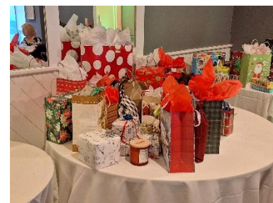
Yankee Swap items.