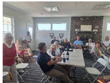
June Rendezvous attendees enjoying the drawing of the ‘Tea Cup’ Auction.