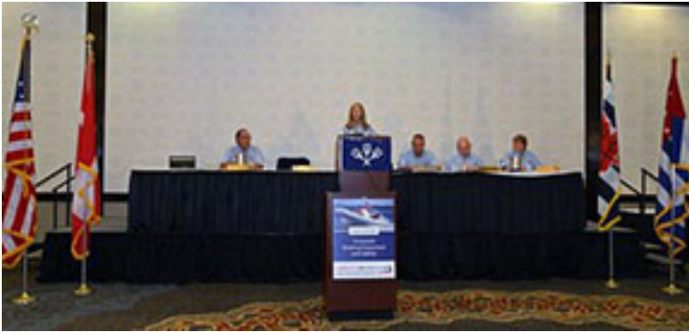
Saturday Morning Meeting