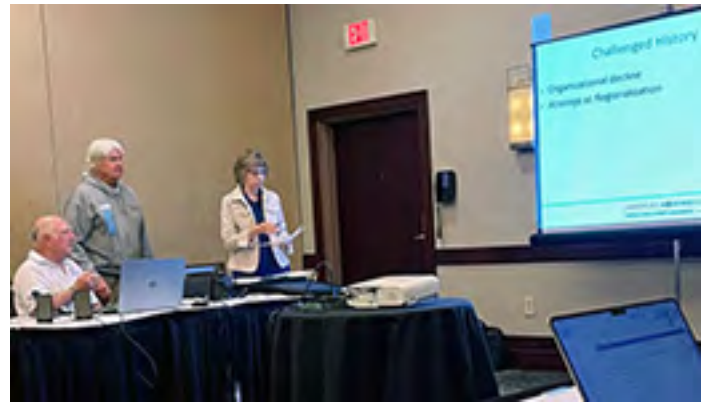
Left, Using Standard Squadron (Web) Sites; above, More Reorg Discussion; below, New Options in Information Center.