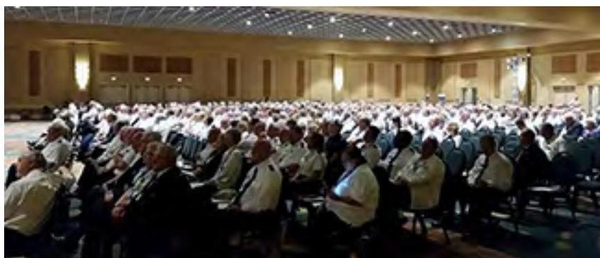
Pretty impressive! 2017 USPS Annual Meeting