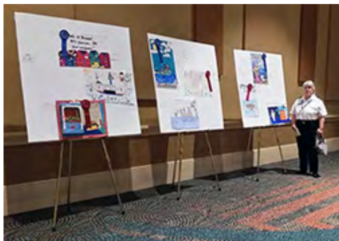
Poster Contest entries and Mady DeArmond