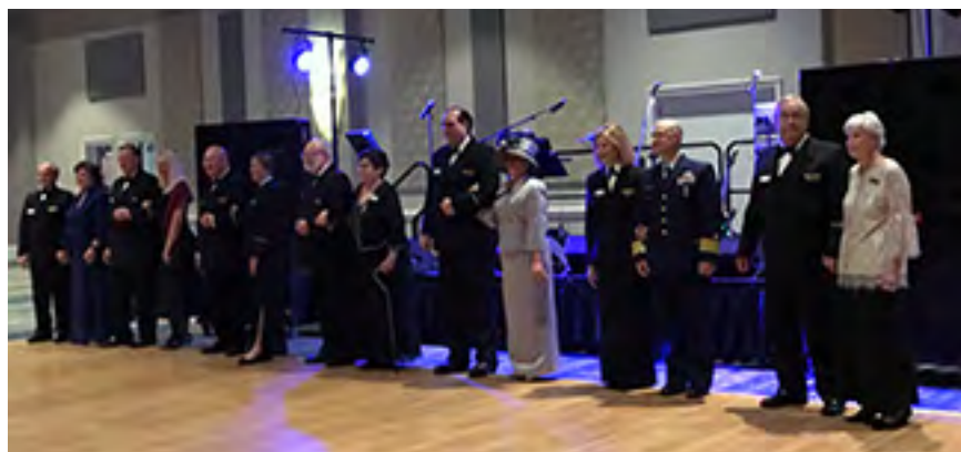
USPS Board of Directors and their escorts