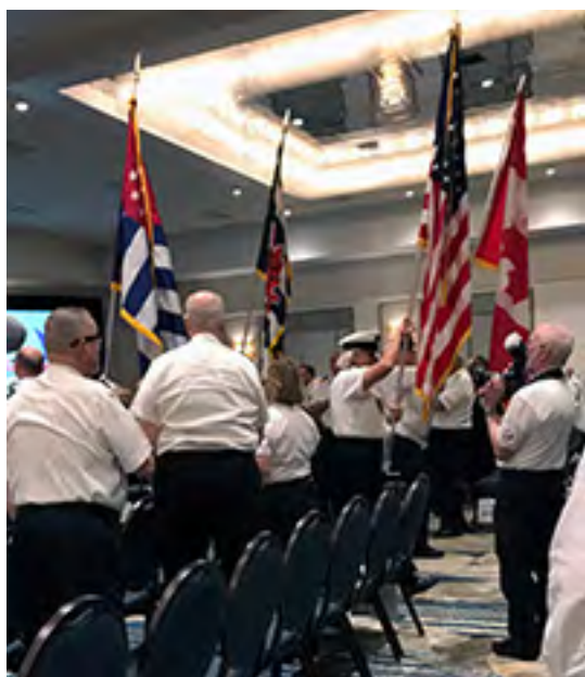
Retiring the Flag