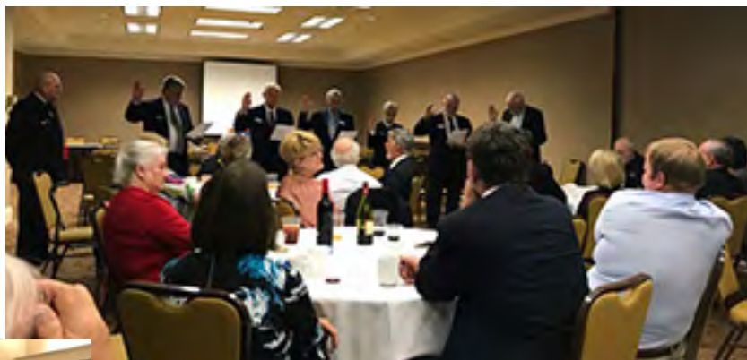
Installation of Officers