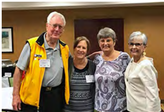
Thanks Perdido Bay for a great conference