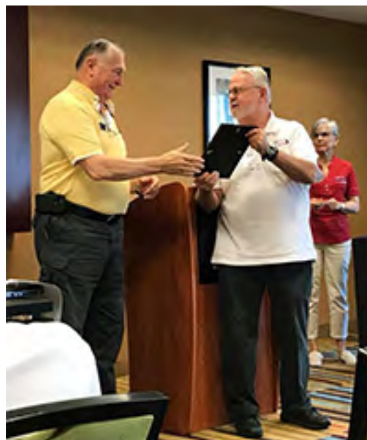
Saturday conference meeting and awards presentations