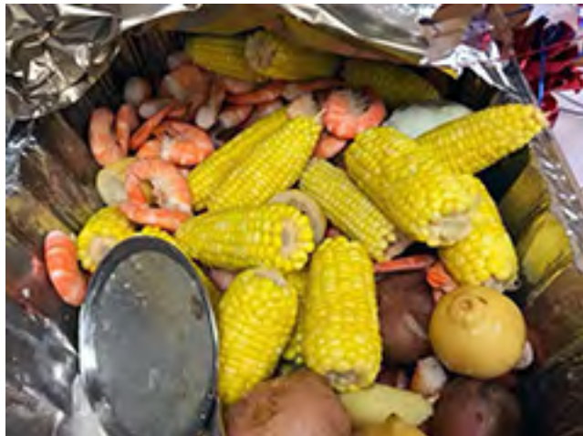
Friday Night Shrimp Boil