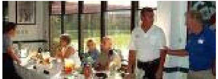
June Dinner Meeting The Clubhouse Daytona Beach