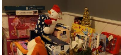
Toys for Tots Donations