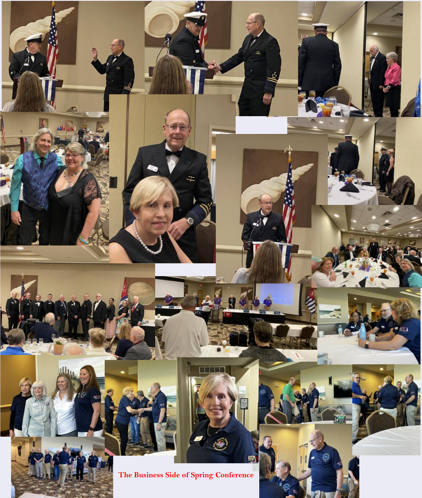
The Business Side of Spring Conference