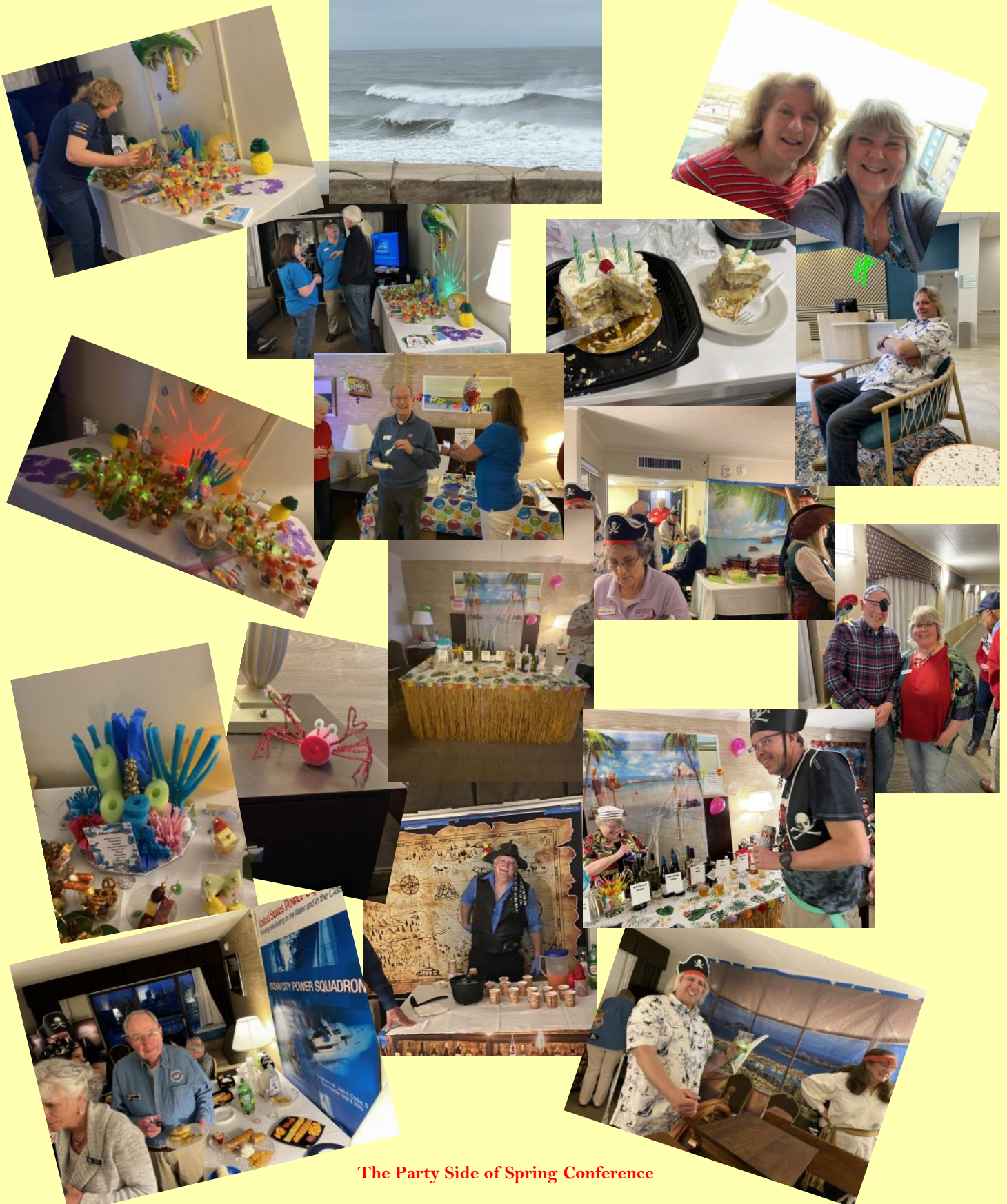
The Party Side of Spring Conference