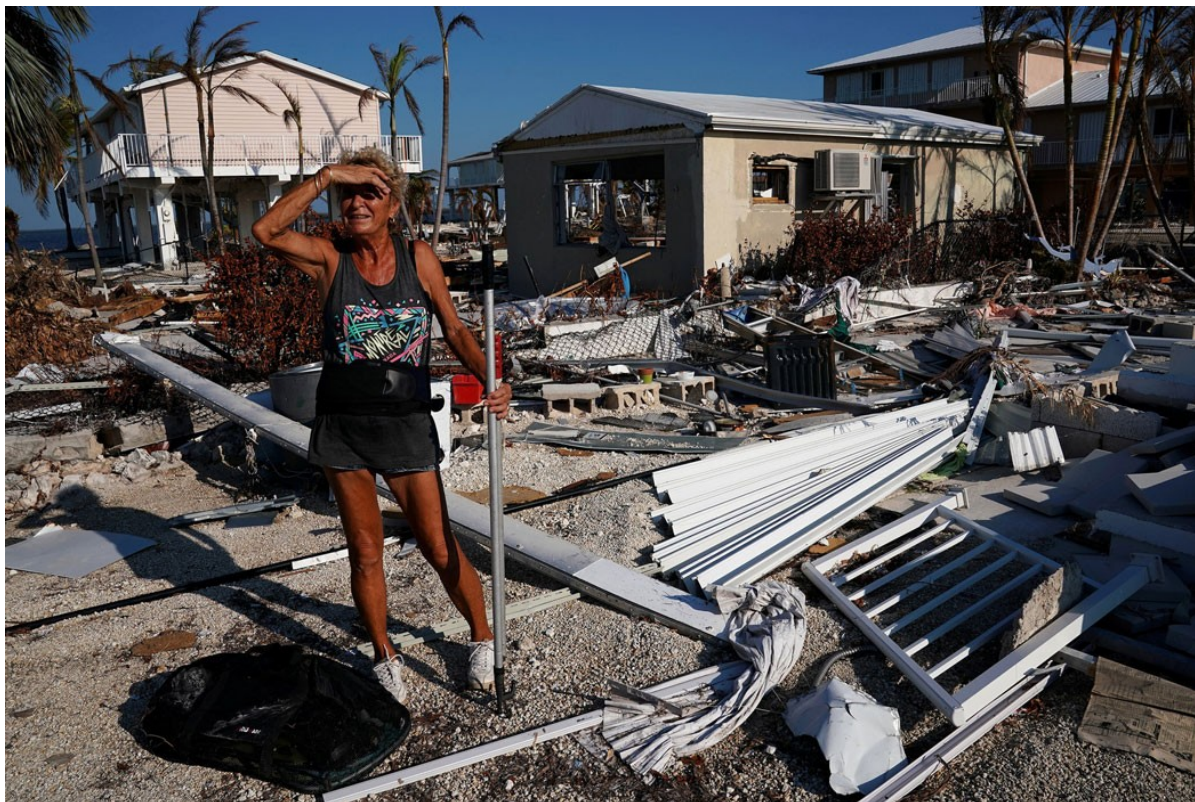
A woman surveys the damage following Hurricane Irma in Big Pine Key, Florida.