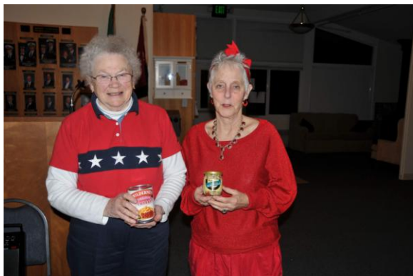
Our Prize Winners