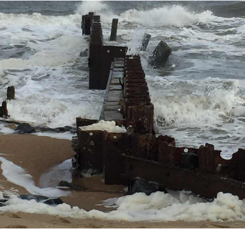
Pawley's Island Beach | South Carolina