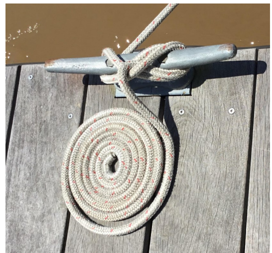
Dock at Rockett's Landing | James River, RVA

Check the calendar for additional updates and please stay healthy and "keep your distance".